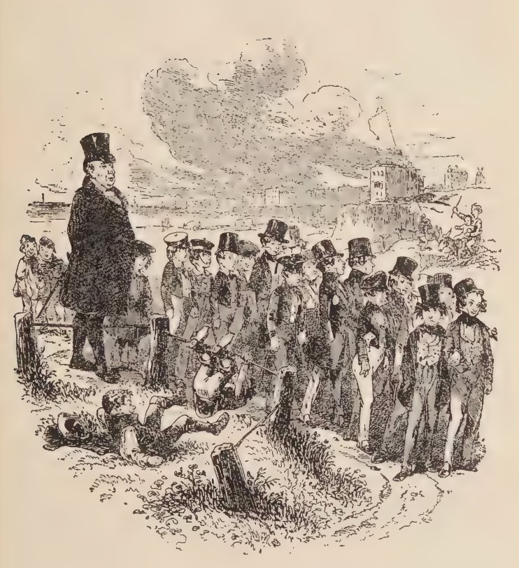
Doctor Blimber's young Gentlemen as they appeared when enjoying themselves.